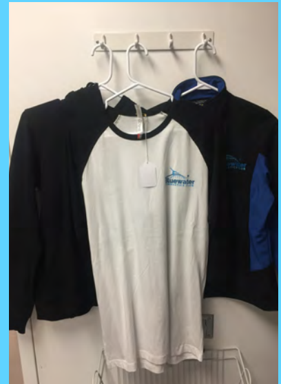
SAMPLE RACK IN OFFICE